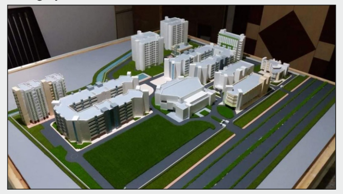
SXUK Campus Plan

With the support of the Alumni Association the 'Vision 2020' project began. The Alumni Association and some individual alumni participated whole-heartedly and actively in this 'Vision 2020'. It has been a hard task and the perseverance has borne fruit by the blessings of the Almighty.