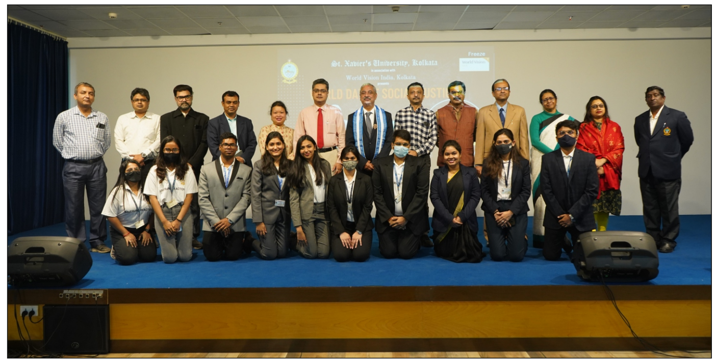
Celebration of World Day of Justice

As we moved on to 2019, our dedication of faculty and students took us far and wide, beyond the four walls of the university towards nurturing young minds by way of fostering and initiating holistic learning in the true sense of the term. Management education should never be confined indoors; one needs to experience the business world around to get a feel of what it takes to be a manager in