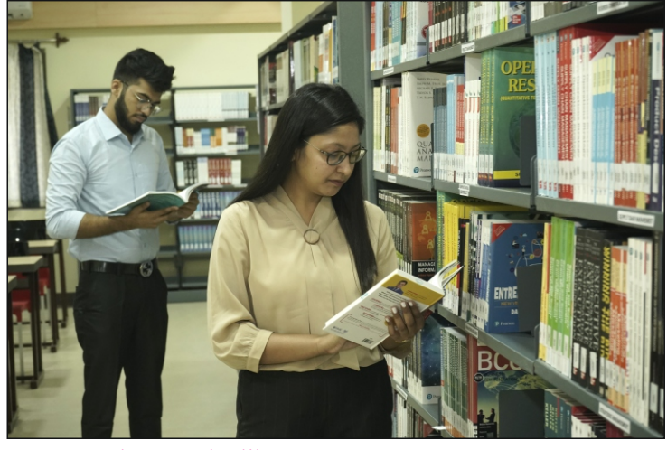
MBA students at the library

Education is the most powerful mechanism with which we can transform the world. It is the passport to the prospect. The Society of Jesus and later the Ramakrishna Mission have been working relentlessly to spread the light of knowledge to dispel the darkness of thousands of years. The knowledge with realm of spiritualty can be more powerful to spread the light. Both the organisations have been doing the same with utter humility and absolute dedication. The knowledge is considered very sacred, therefore, it is also very important to prepare the domain of how to acquire the knowledge. The Society of Jesus and Ramakrishna Mission are masters in building the array learners who acquire