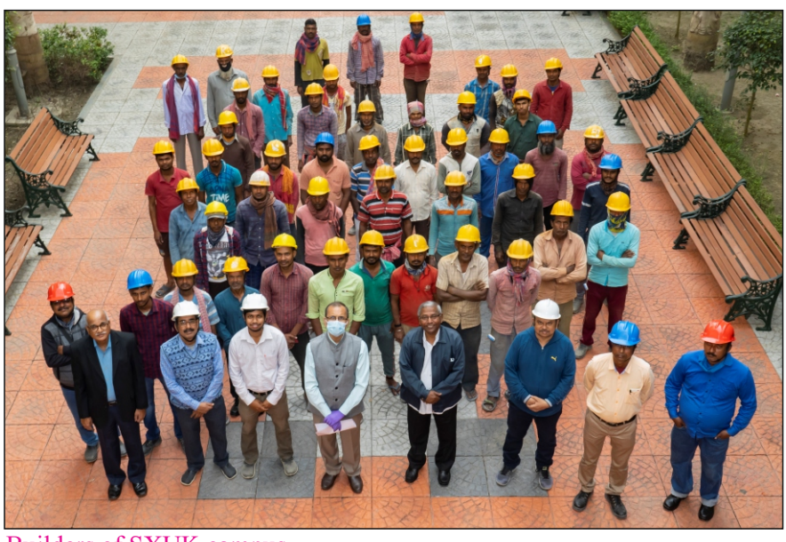
Builders of SXUK campus

Infrastructure plays an important role in the education sector. Buildings, good classrooms, libraries, auditoriums, laboratories, green-clean campuses, ICT facilities, residential facilities on campus etc. are crucial for a learning environment and to improve the performance of students. We believe that high-quality