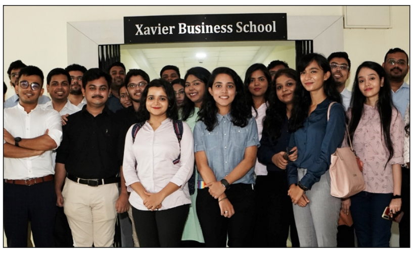
Section of MBA students at SXUK

joined on board in August 2020, there were the XBS-SXUK alumni in the industry who had kept no stones unturned to see their XBS shine with glitter in the outside world. The placements of 2021 for the second batch were