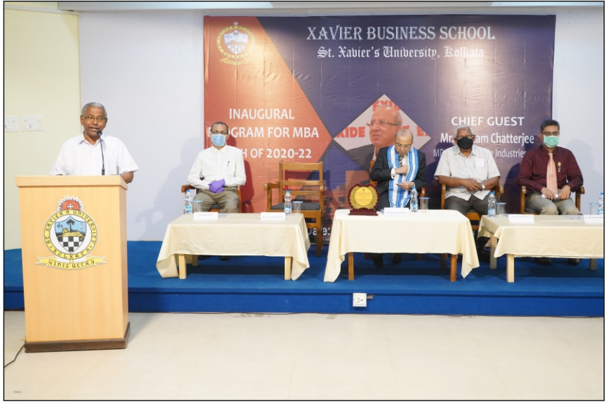
Virtual inauguration of MBA Batch 2020-22

practice. Keeping this is mind we had organized industrial visits to organizations both within and outside Kolkata. The trips outside Kolkata had a deeper intention in mind to allow for unwinding and distressing one's mind and body