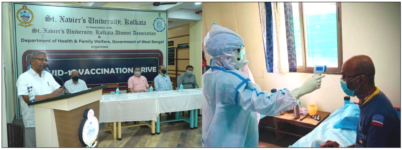
COVID-19 Vaccination drive at SXUK

I am thankful to St. Xavier's University, Kolkata for providing me the immense exposure to work and learn till date.