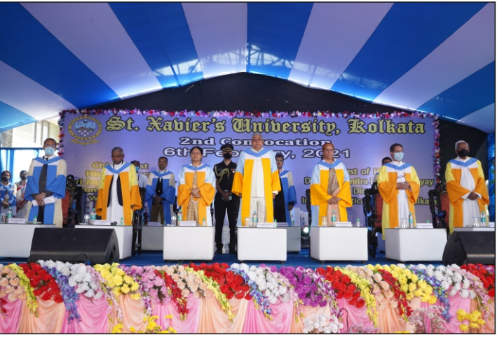
Second Convocation, 2021

When all other institutions of repute were struggling with their regular undertakings, our founder Vice-Chancellor proved that every obstacle could be converted to an opportunity. During these extraordinary situation, the university has not only been accomplishing its consistent activities related to academics in different arrangement and alternative platforms, but also has been reaching the neighbourhood with a healing touch. It has shown its responsive attitude and accomplishment of commitment towards the society. For us the vision and mission are not