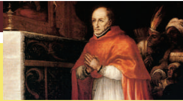
St. Turibius of Mogrojevo

St. Turibius of Mogrojevo Feast Day: 23 March St. Toribio Alfonso de Mogrovejo (16 November 1538 – 23 March 1606) was a Spanish prelate of the Catholic Church who served as the Archbishop of Lima. Prominent in the history of the Catholic Church in Peru, Saint Turibius of Mogrovejo supported the rights of the native people.