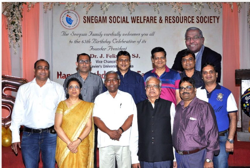
The GB Members with their President