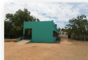
The newly painted classrooms