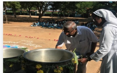
Father blessing and inaugurating the pongal celebration