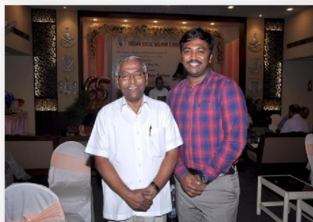
Father celebrating his birthday with Family and Friends