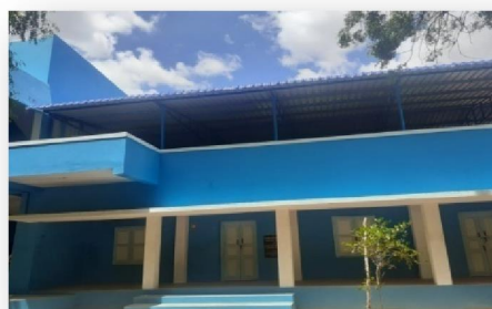
The newly constructed Shed supported by Snegam