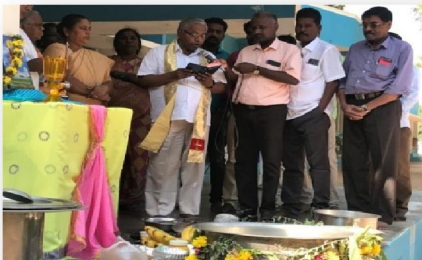
Father leading the prayer during Pongal celebration

Snegam helped to develop the school in terms of infrastructure. A library was built for the benefit of the students. Recently Snegam supported in building a Shed over the terrace for multipurpose use. The flooring work is in progress. Presently there are 350 students (185 girls & 165 boys).