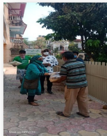
Ration being distributed to migrant workers