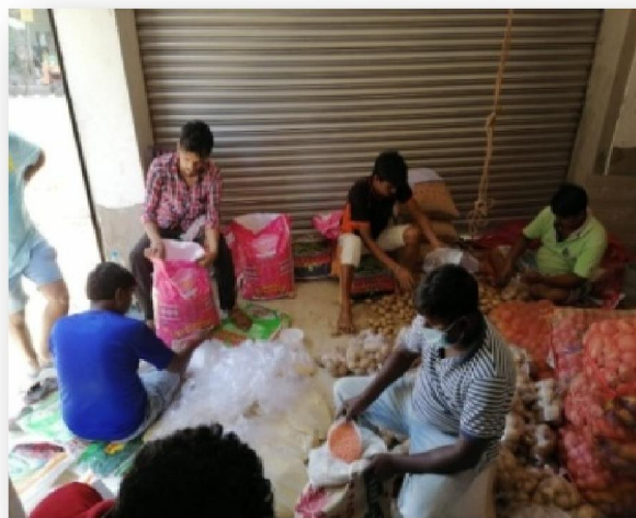
Volunteers packing dry ration

Upon receiving an SOS from Sundarbans on April 7 through Genesis hospital, Kolkata, Snegam and SXUK responded immediately and sent Rice, Dal, Potatoes and Salt for 300 families of tiger victim widows in and around Amlamethi village in Sundarbans.