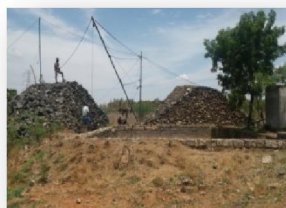
The well being deepened